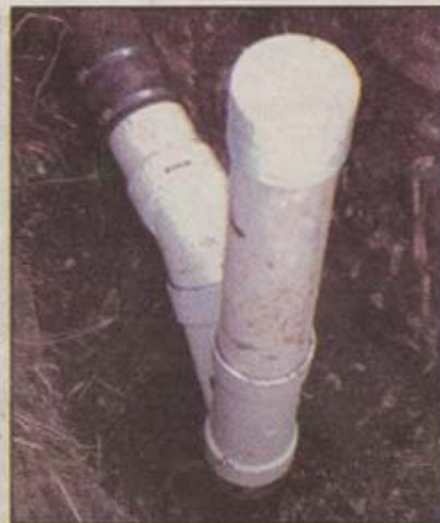
A "before" and "after" photo of a drain pipe repaired by B&L Plumbing.